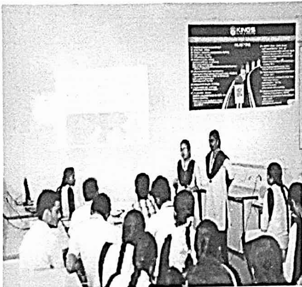
Team of participants presenting their paper