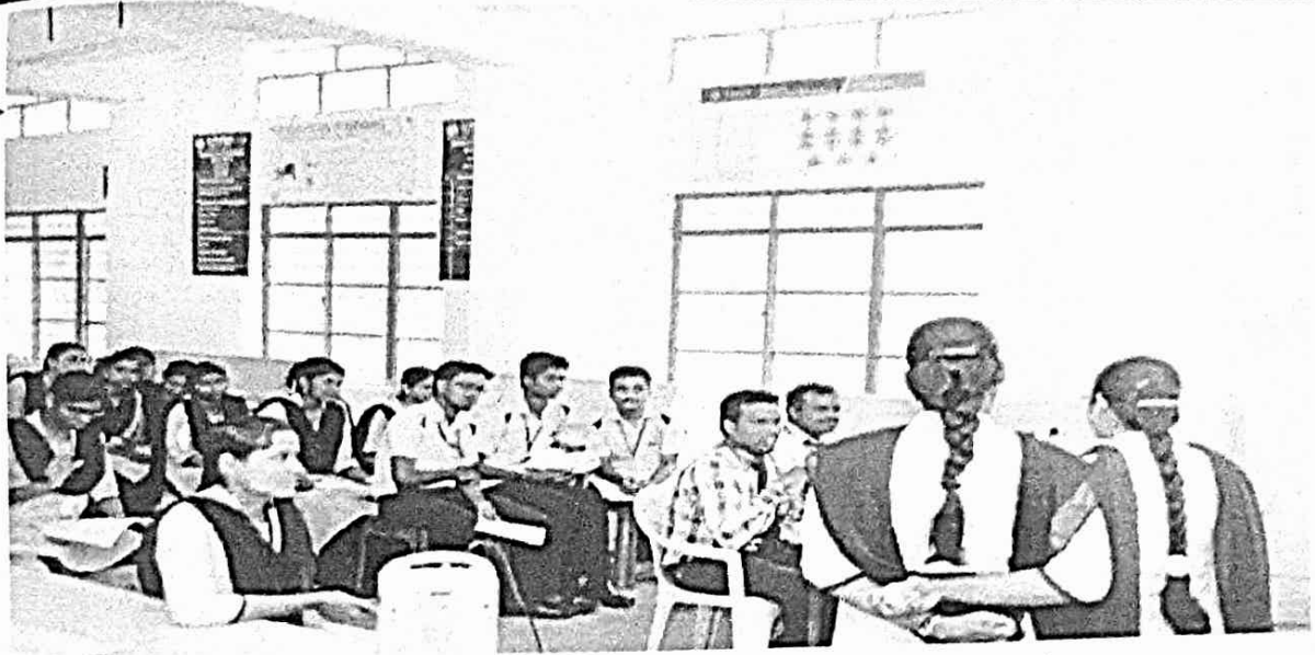
Team of Juries earnestly evaluating the presentations